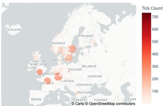
Fig. 2. Tick occurrence Bubble Map detailing DBSCAN clusters.