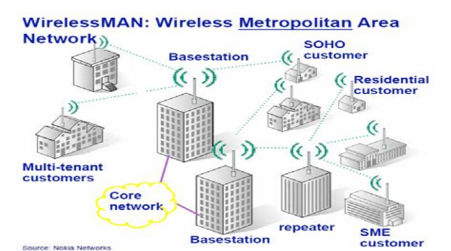
Fig. 1. Point-to-multipoint wireless metropolitan area network ...

The standard defines two operation modes: Mesh mode and Point-to-Multipoint (PMP) mode [4]. Mesh mode supports direct communications between Subscriber Stations SSs without the need for a Base Station BS. For PMP topology, a controlling BS connects multiple SSs to various public networks as shown in the Fig. 1.